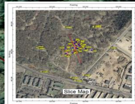
CDM MIP Data Visualization Harrison Avenue Landfill Site City of Camden, New Jersey